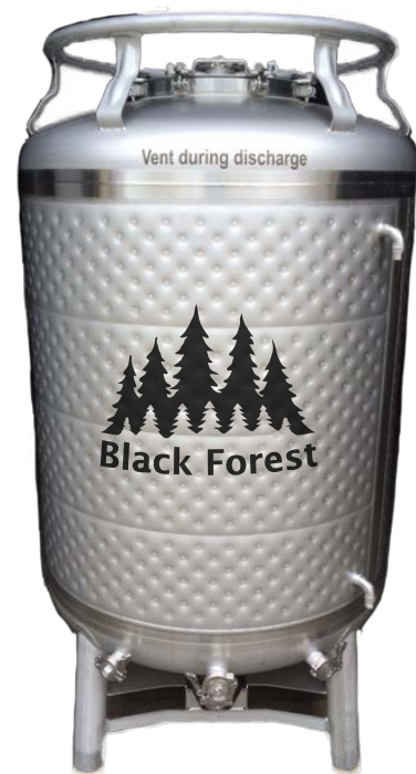
8.33bbl /1000L Jacketed Fermentation Tank